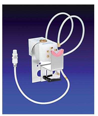
Huestis "Down Drafter" Air Wiper shown closed (above left), open (above right) and with close-up of air wipe (lower right).