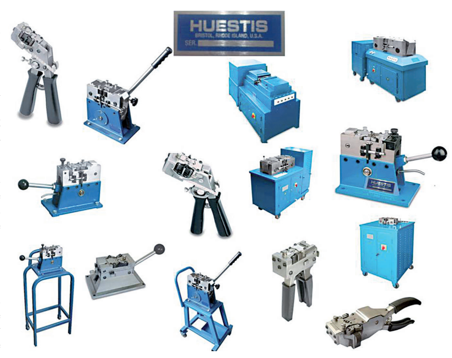
Huestis cold pressure welder family of products.

To learn more about the Ceramic "Air Miser", "Down Drafter" Air Wiper, Shaftless Series of payoffs and take-ups and the new line of cold pressure welding machines and dies, visit the Huestis Industrial website listed below.