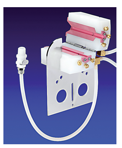
Huestis Ceramic "Air Miser" shown closed (above left), open (above right) and with close-up of air wipe (lower left).