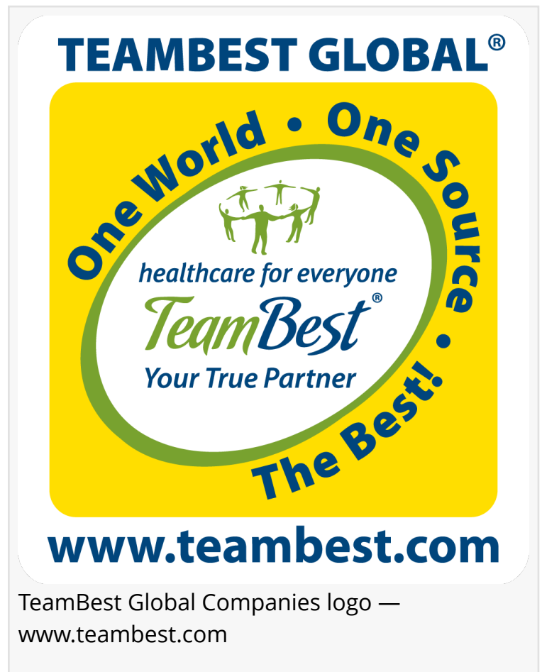
TeamBest Global Companies logo — www.teambest.com